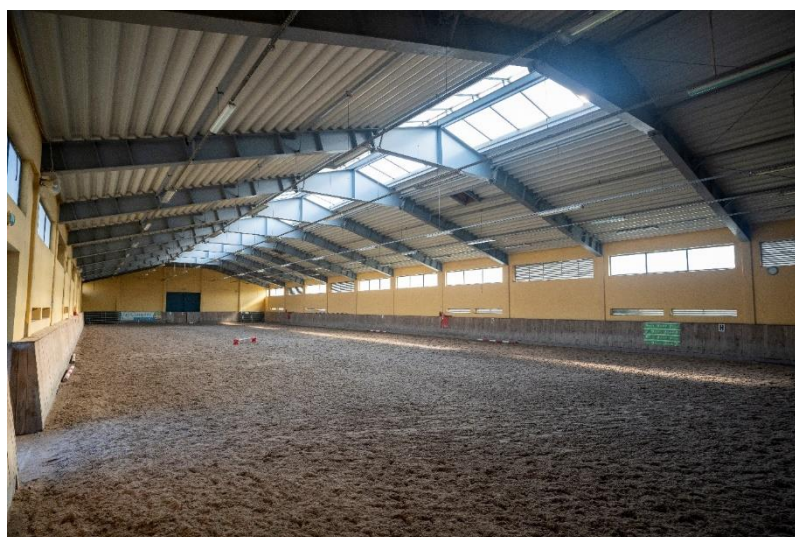
Training Arena 60 m x 20 m